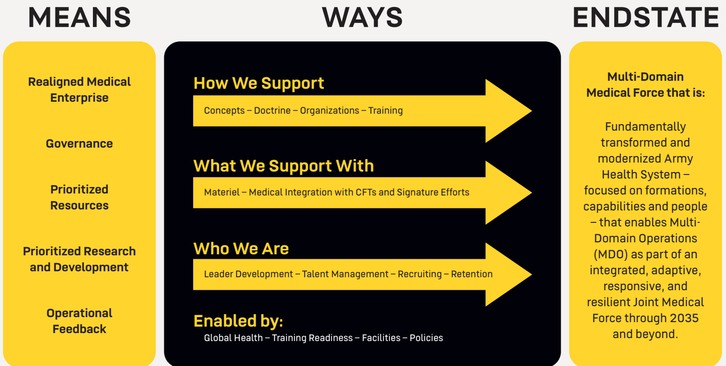
Figure 1. The Army Medical Modernization Framework

END STATE: A fundamentally transformed and modernized Army Health System that enables the Army to fight and win as part of the Join Force.